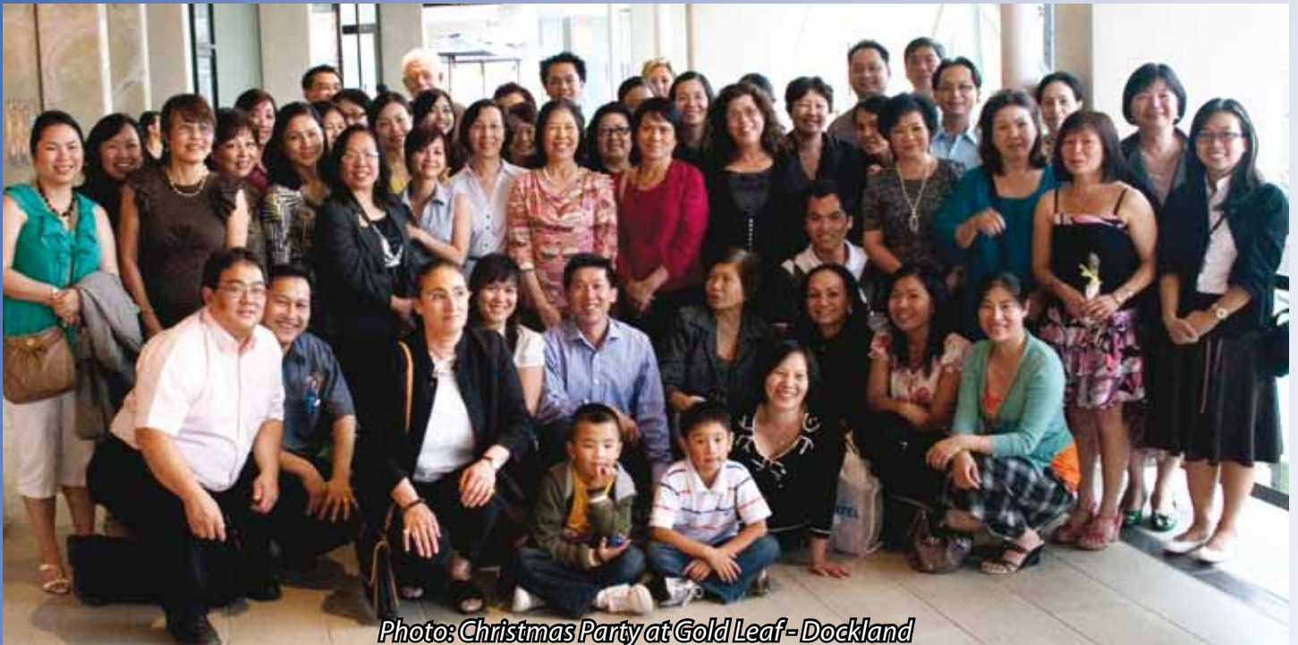
Photo: Christmas Party at Gold Leaf- Dockland