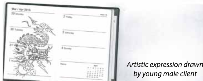
Artistic expression drawn by young male client

The prisoner and his relatives started to rebuild a close relationship and have never looked back to the past.