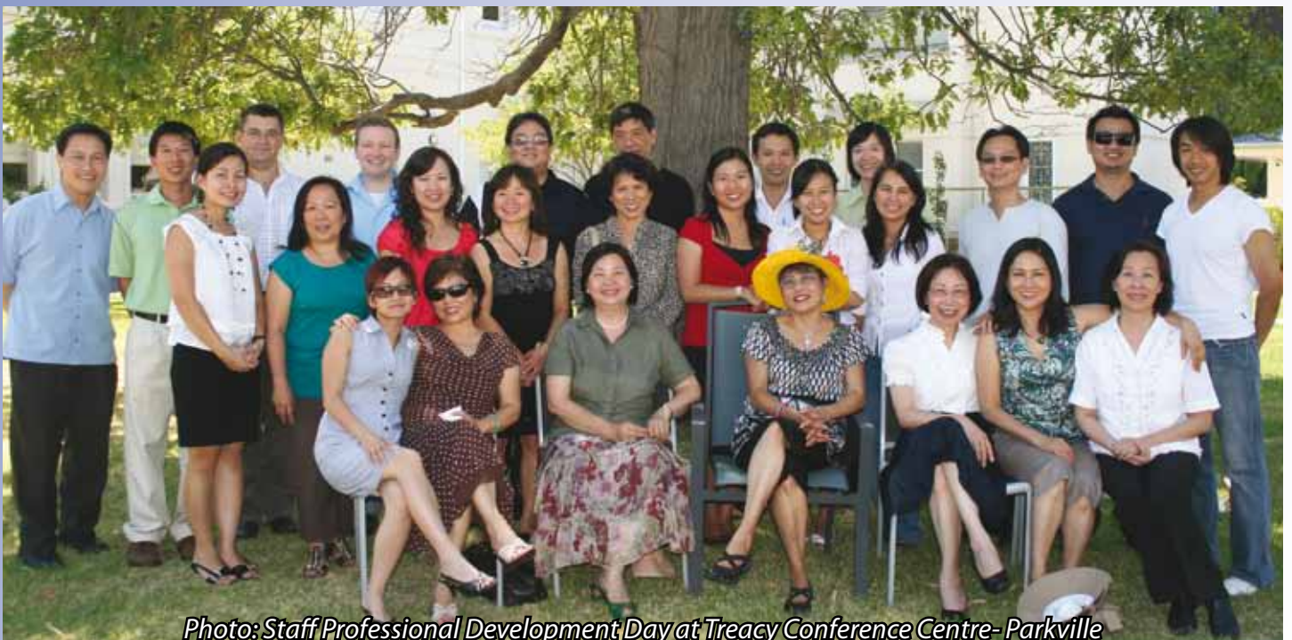
Photo: Staff Professional Development Day at Treacy Conference Centre- Parkville