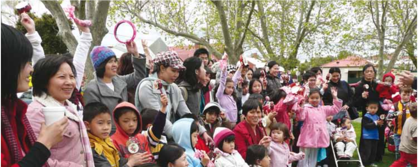
Richmond and Collingwood Playgroups