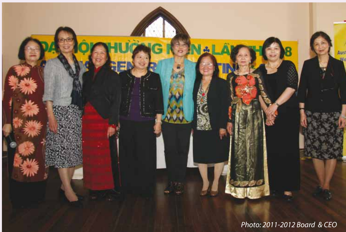
Photo: 2011-2012 Board & CEO