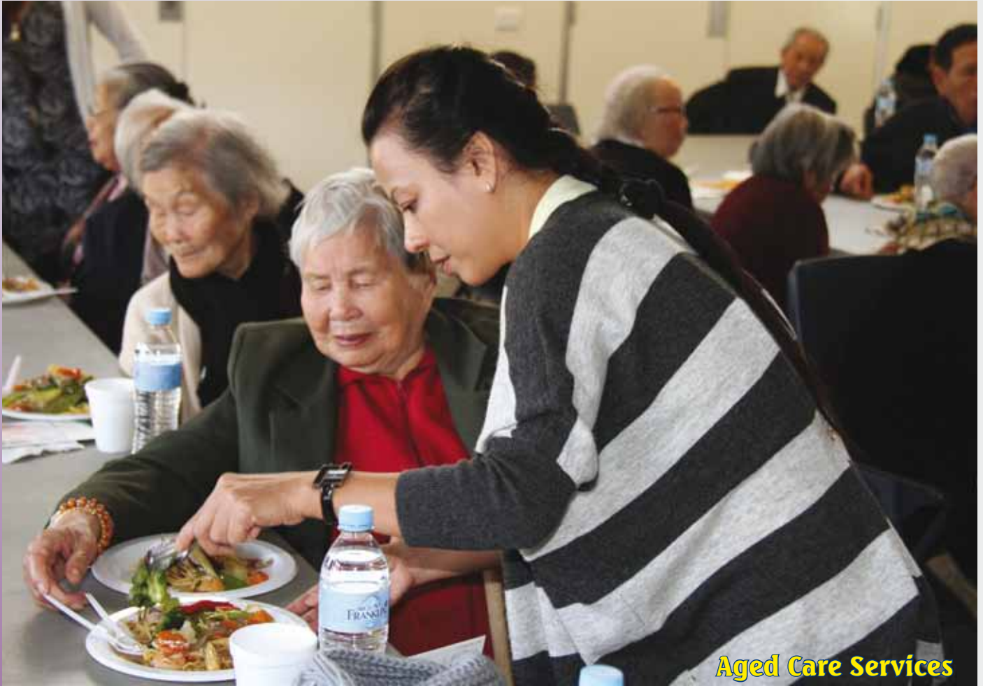
Aged Care Services