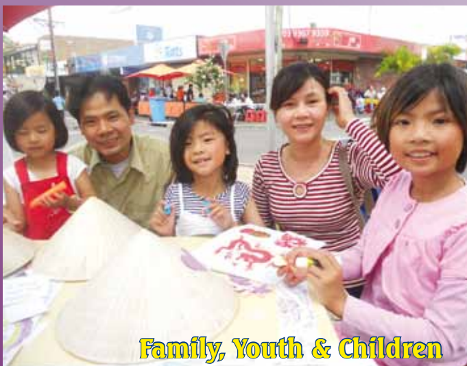
Family, Youth & Children