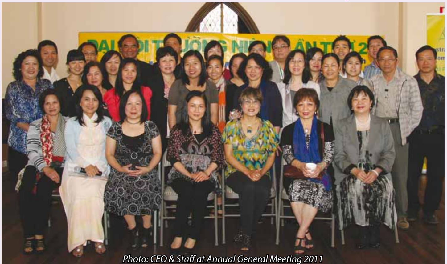
Photo: CEO & Staff at Annual General Meeting 2011

Improve their health, happiness and well-being