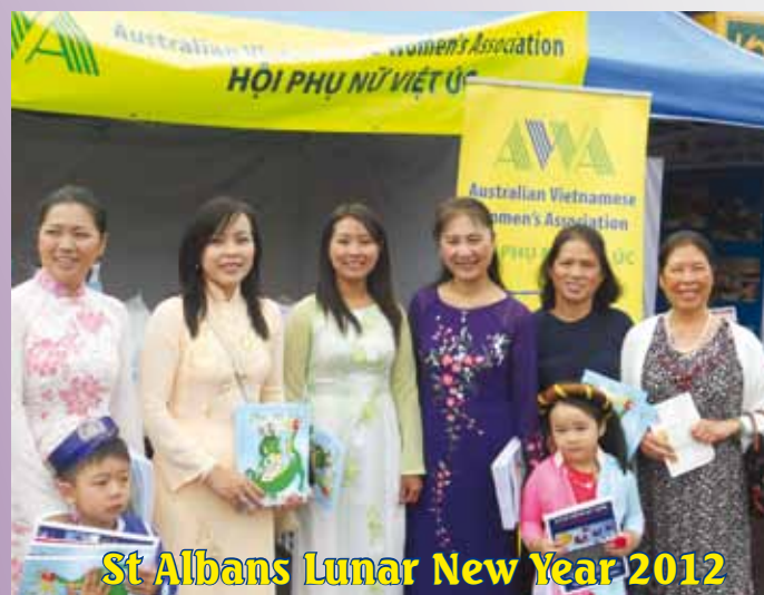
St Albans Lunar New Year 2012

For more information about the Australian Vietnamese Women's Association, visit www.avwa.org.au , email info@avwa.org.au , call the Richmond office on 03 9428 9078 or the Footscray office on 03 9396 1922.