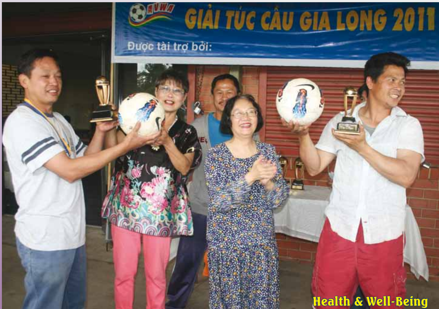
Health & Well-Being

Richmond Office, 30-32 Lennox Street, NORTH RICHMOND VIC 3121 PO BOX 1024 RICHMOND VIC 3121 Phone + 61 (3) 9428 9078 - Fax + 61 (3) 9428 9079 Footscray Office, Level 1, 144-148 Nicholson Street, FOOTSCRAY VIC 3011 PO BOX 2336 FOOTSCRAY VIC 3011 Phone + 61 (3) 9396 1922 - Fax + 61 (3) 9396 1923 ABN 69 724 826 405