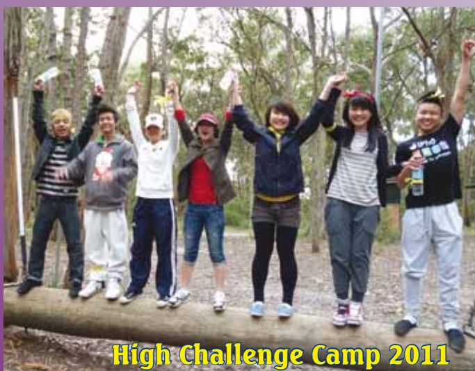
High Challenge Camp 2011