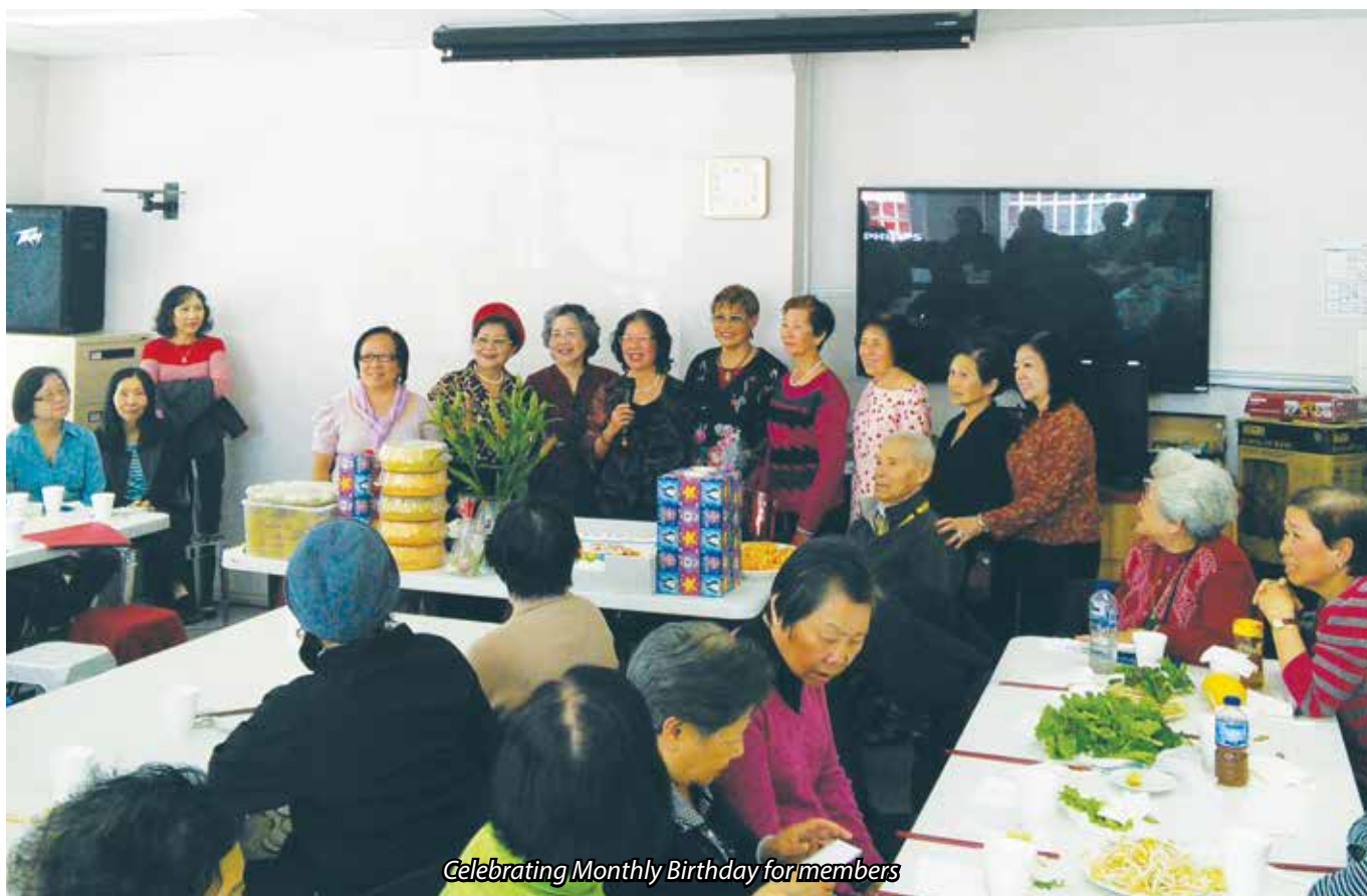
Celebrating Monthly Birthday for members