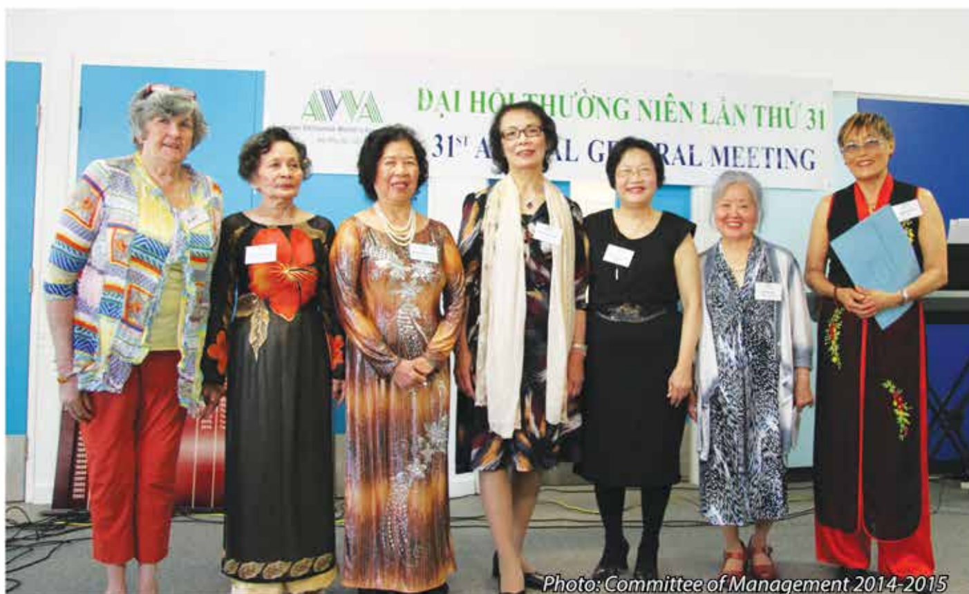
Photo: Committee of Management 2014-2015