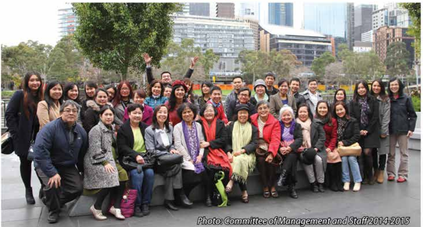
Photo: Committee of Management and Staff 2014-2015

Improve their health, happiness and well-being