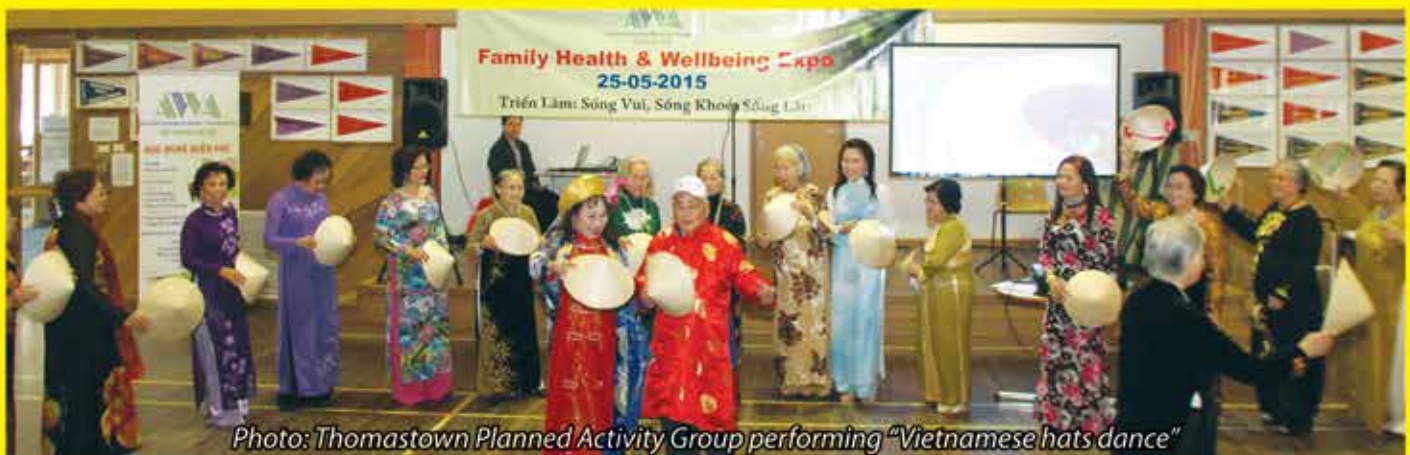
Photo: Thomastown Planned Activity Group performing "Vietnamese hats dance"