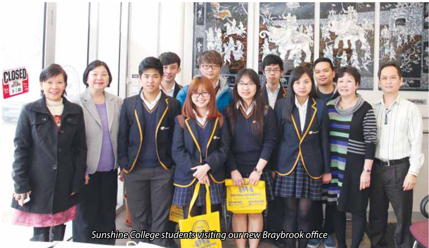
Sunshine College students visiting our new Braybrook office

AVWA provides opportunities for all individuals, irrespective of age or gender, to take part in our volunteer projects and student placement programs.