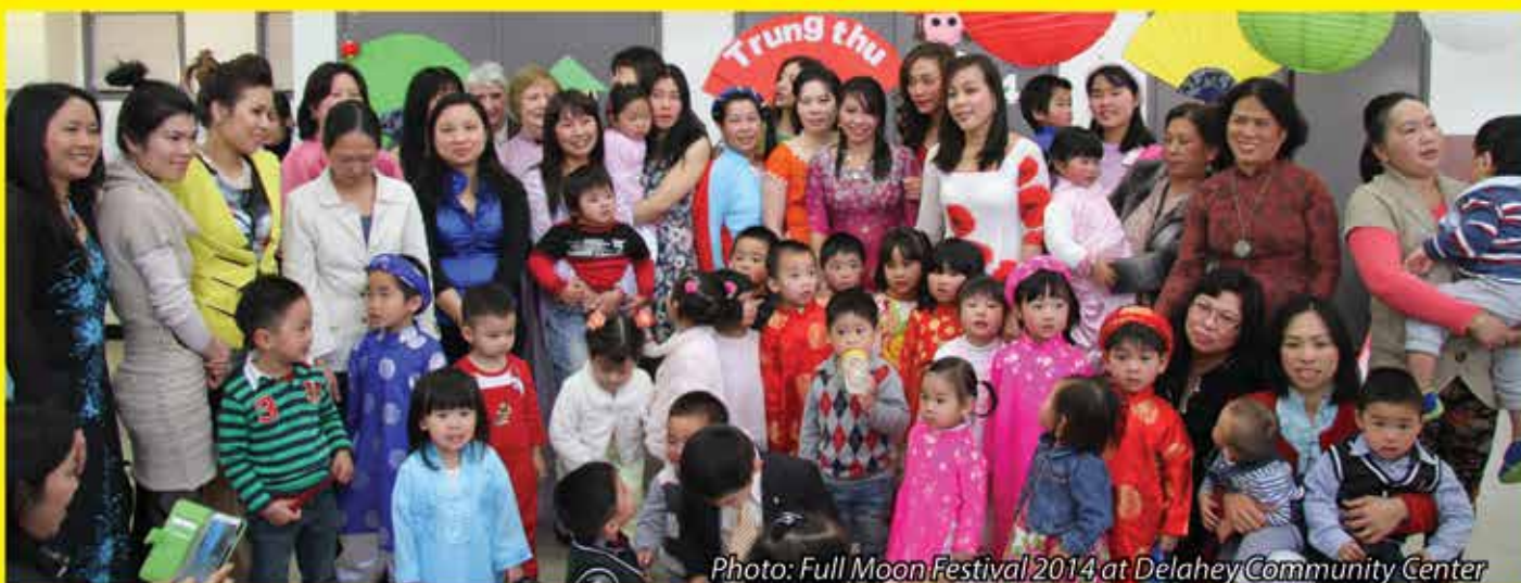
Photo: Full Moon Festival 2014 at Delahey Community Center

For information about the Australian Vietnamese Women's Association, visit www.avwa.org.au , email info@avwa.org.au , call the Richmond office on 03 9428 9078 or the Braybrook office on 03 9396 1922.